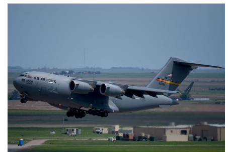
C-17 with door open on the flightline (top), and a KC-135 at takeoff (bottom).